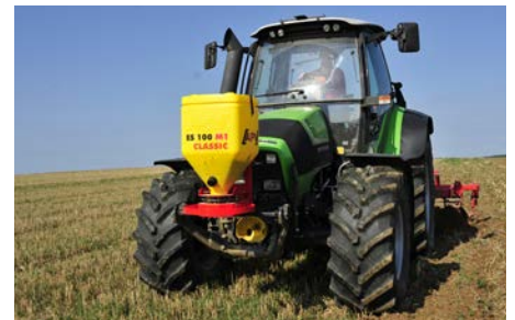
The upper linkage mechanism accomodates 3-point hitch mounting.