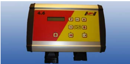
Model 4.6 Controller for precision spreading applications.

Due to its design and various control functions, the ZS 200 M4 is THE slug pellet spreader. Independent tests prove the ZS 200 to be the industry leading twin disc spreader in accuracy and distance. The independently driven spreading impellers provide a precise symmetrical pattern which is maintained at spreading widths in excess of 100 feet. The ZS 200 M4 also offers great precision in the seeding of grass, cover crops and other granular products. Spreading can be accomplished simultaneously with field preparations by mounting on a tillage implement.