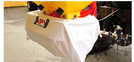
APV seeders come with everything you need for easy, accurate calibration.