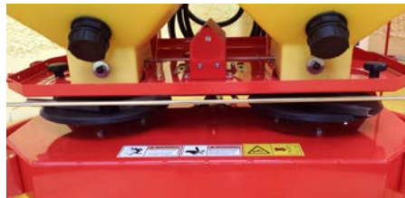
The ZS 200 M4's twin disc design delivers precise spreading widths.