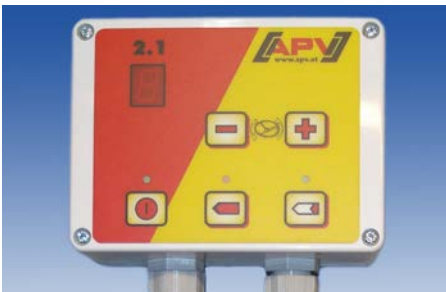
The 2.1 Controller is supplied with the ES 100 M1 Classic.

The ES 100 M1 Classic is ideal for spreading grass seeds, single cover crop seeds, granular micronutrients and slug pellets. The lightweight poly hopper has 3.53 cubic feet of capacity and provides long life, impervious to the environment. The spreading width and disc speed are directly controlled by the 2.1 Electric Controller from your tractor cab and the seeding rate is quickly set with an adjustable slide gate. With spread patterns up to 78 feet, depending on material, APV spreaders lead the industry in broadcast precision.